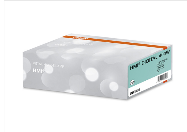
New HMI® packaging